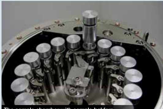
The sample chamber with sample holders.