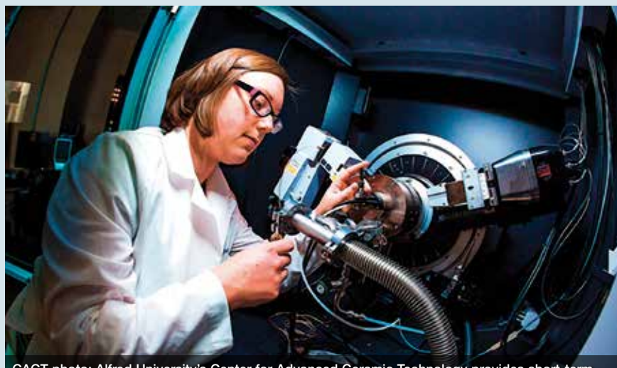
CACT photo: Alfred University's Center for Advanced Ceramic Technology provides short-term analytical programs, sponsored research, internships, and workforce development programs for New York State companies.

"Small business can be very fast-moving and innovative," he says. "But government labs have resources that are unique and specialized, so there's a natural synergy there, in some cases."