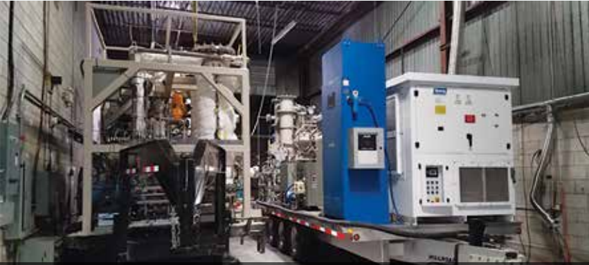
A soil scrubber to clean chemical warfare agents, left, was developed for DARPA by the Southwest Research Institute, San Antonio, Texas.

Please visit http://www.pmddtc.state.gov/regulations_laws/itar.html for more detailed information regarding ITAR/EAR requirements.