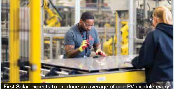
First Solar expects to produce an average of one PV module ever 2.75 seconds across its three-factory Ohio footprint.

First Solar, Inc. says it will invest $680 million to expand its U.S. domestic photovoltaic (PV) solar manufacturing capacity by 3.3 gigawatts annually, constructing its third U.S. manufacturing facility in Lake Township, Ohio. The facility is expected to begin operating in the first half of 2023. Tempe, Ariz.-based First Solar produces ultralow carbon, thin film PV modules using a fully integrated, continuous process under one roof. In addition to its Ohio manufacturing facilities, First Solar also operates factories in Vietnam and Malaysia.